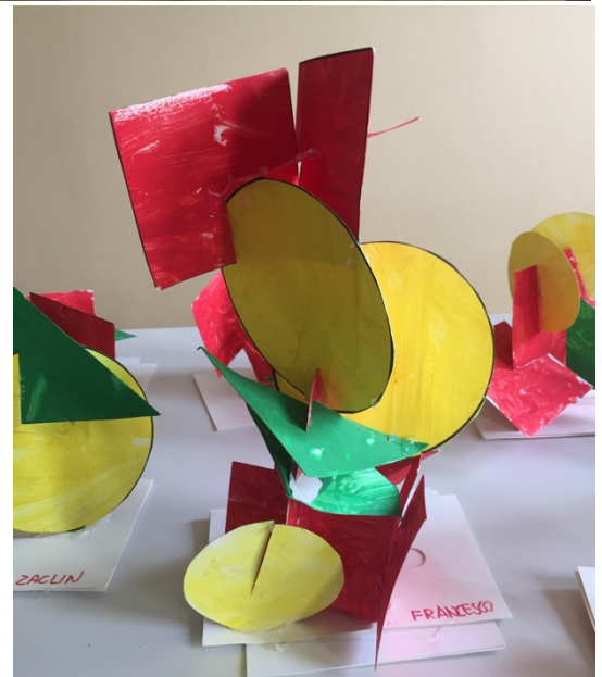
Fine figure geometriche Alessandra